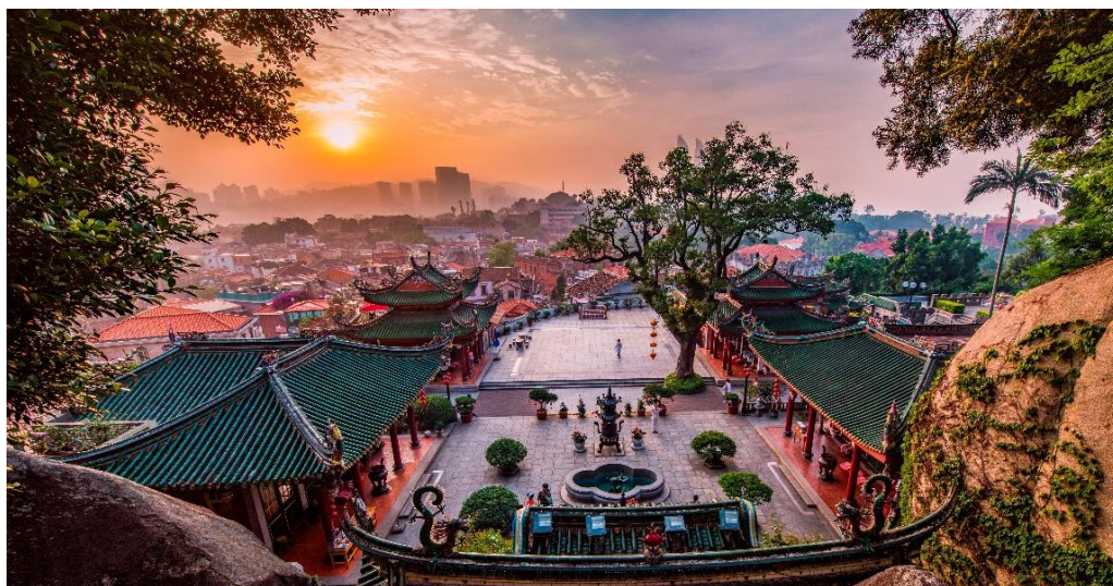
XIAMEN (AMOY), CHINA

The 10th China-Japan-Korea Symposium on Radiopharmaceutical Sciences (CJKSRS 2018)